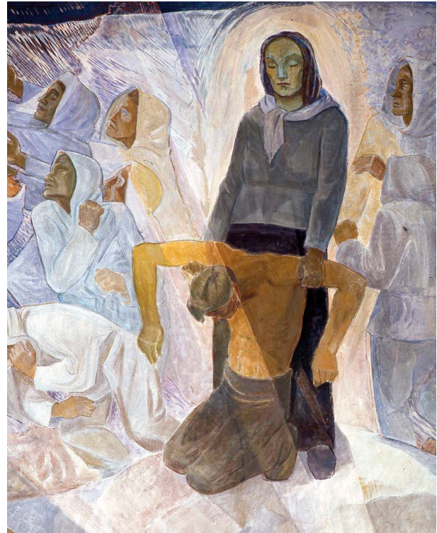
BATTLE Mother Finland Sacrifice to freedom