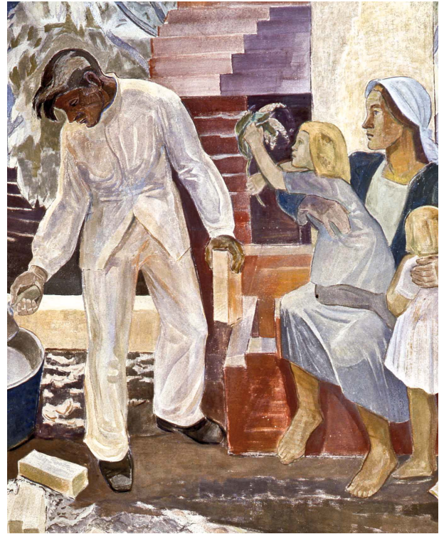
RECONSTRUCTION Home and society

Everything has now changed. The peace of a spring morning follows the icy darkness of winter. Children are playing free from worry about death and destruction, carefree among blooming anemones and willow. A soldier's wife welcomes home her returning husband, a front-line soldier who still wears the tension of the fight in his features. Two young men are standing in the farthest corner on the left in down-flowing light, the curtain of the future, and plough a new field for the country. They represent shared mental and physical work and could, independent of their types, also represent mutual understanding between classes and