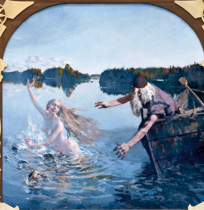
Aino escapes from Väinämöinen's boat.