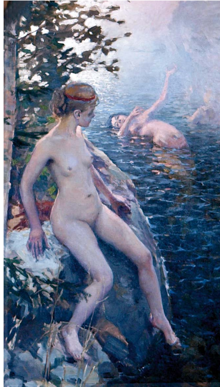
Aino going to swim with the maids of Vellamo.

the portrayal of mythological scenes through the methods of realism in a homely, even modest landscape.