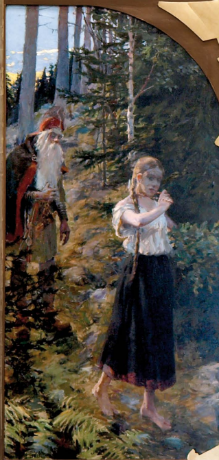
Aino encounters Väinämöinen in the forest.